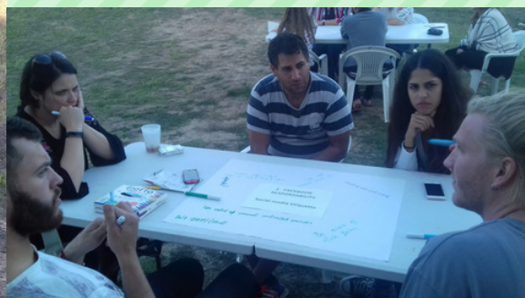
Media literacy and critical thinking