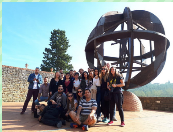
Cultural visit in Vinci