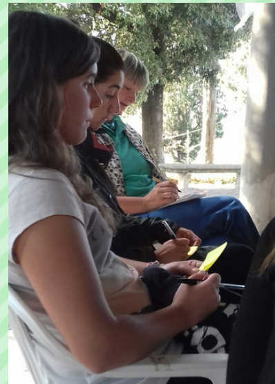
Feedback: to give and receive