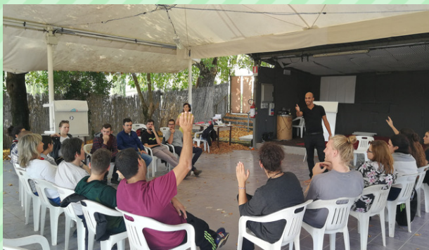
Public Speaking workshop