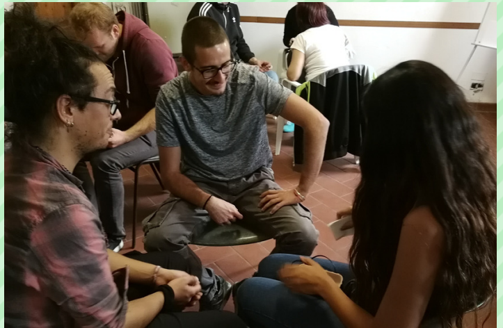
Getting to know each other