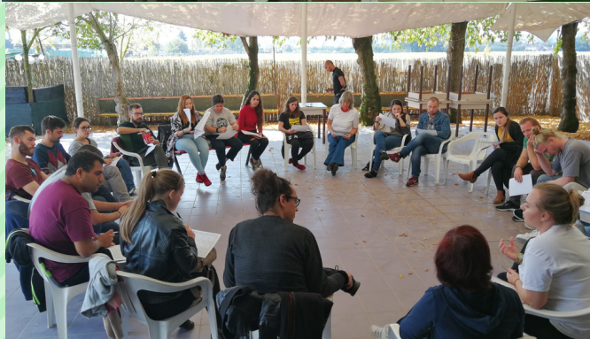
"Amazing Island" Game & Debriefing session