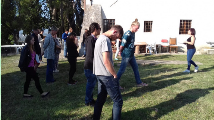
One Step Forward