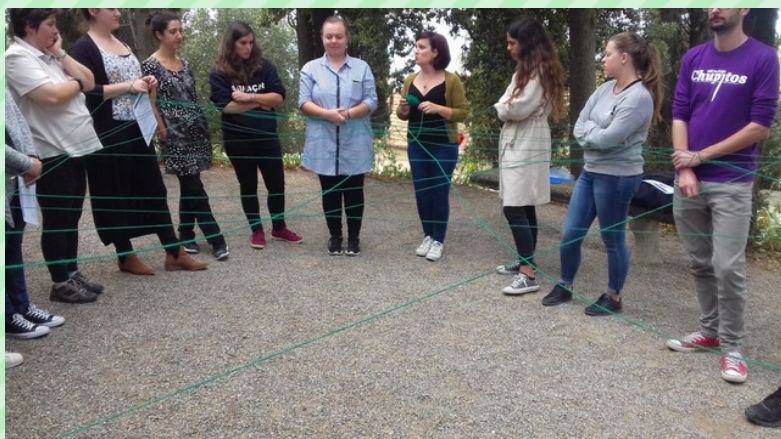
Time to say goodbye