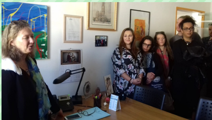
Meeting with the responsible of Youth Policies