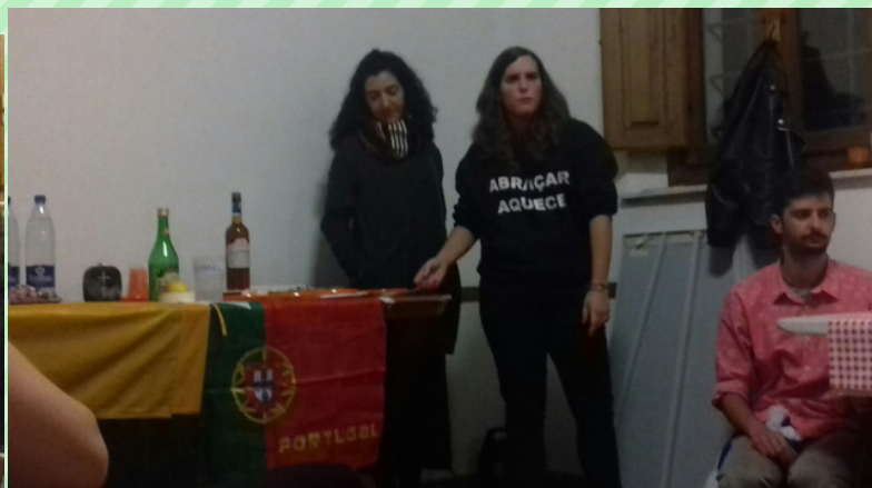
Cultural identity night