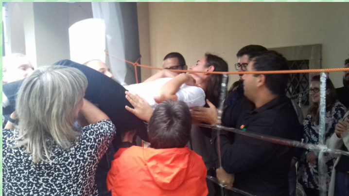
Team building games