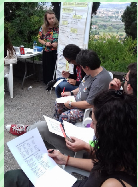
Non violent communication