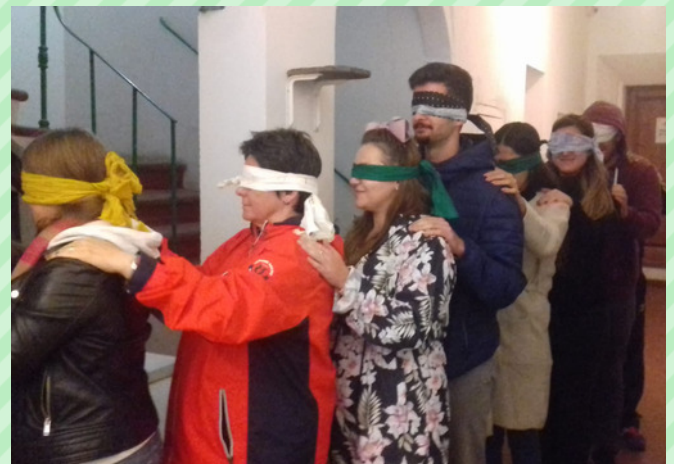
Train of communication